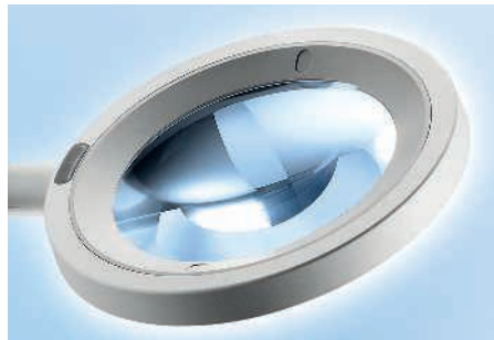
Long service life Premium scratch-resistant plastic lens and precision components ensure strong durability

Ergonomic handling Spring balanced arm and friction joints allow smooth handling without the luminaire head sinking