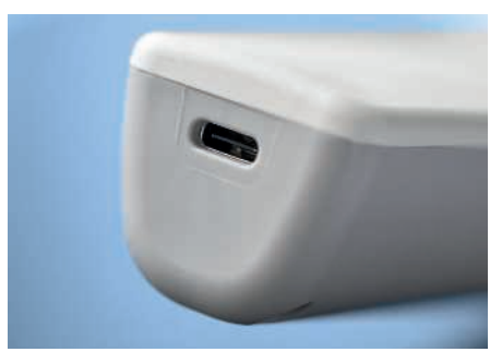
Battery powered Up to 3 hours runtime, convenient charging through USB-C port