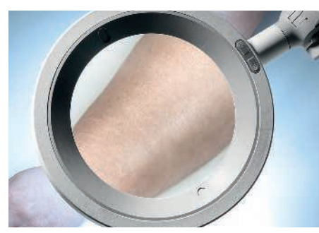
Reliable color rendering Very good 6 500 K LEDs ensure less shadow formation and optimal color rendering

Excellent light field Due to large magnifier diameter (Ø 160 mm, 3.5 dpt) and strong, dimmable illumination (6 000 lx at 0.15 m)