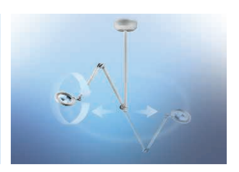
Flexible positioning Long luminaire arm allows a broad reach up to 142 cm radius